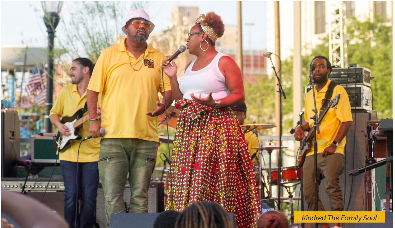
Kindred The Family Soul