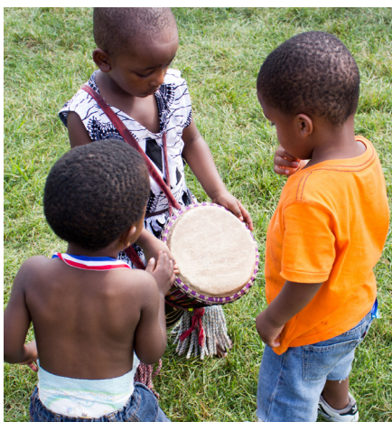
Universal Dance & African Drum Ensemble