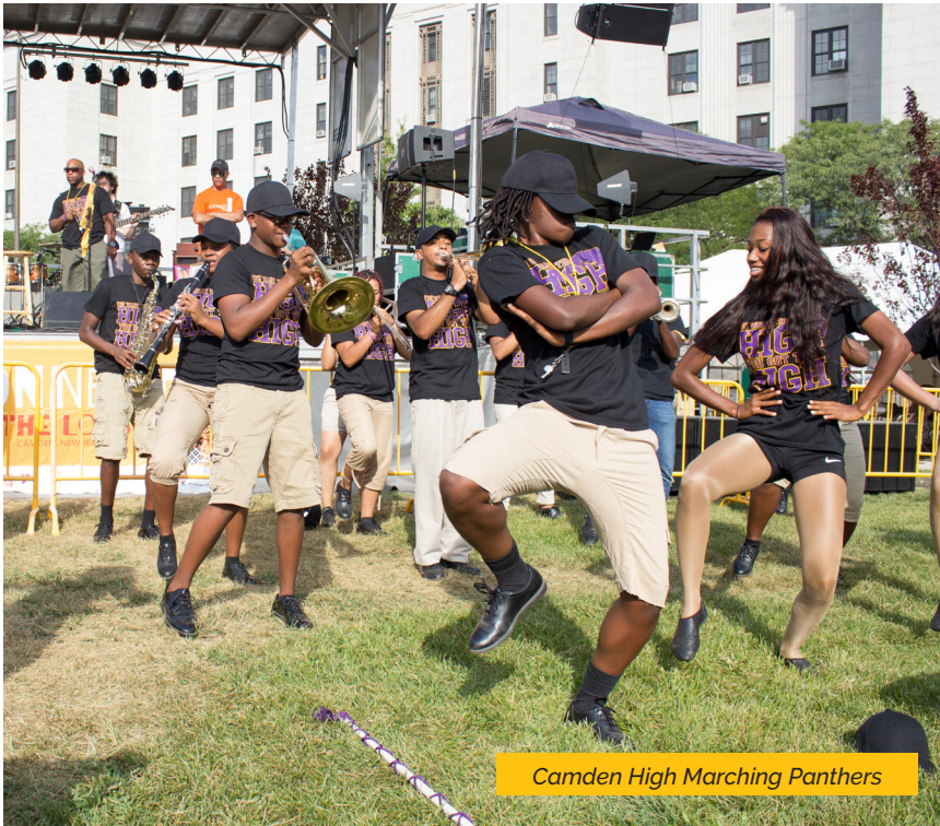
Camden High Marching Panthers