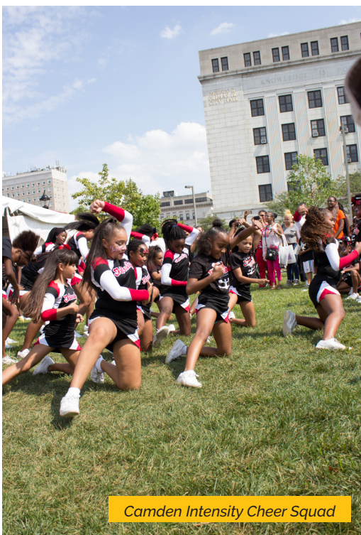
Camden Intensity Cheer Squad