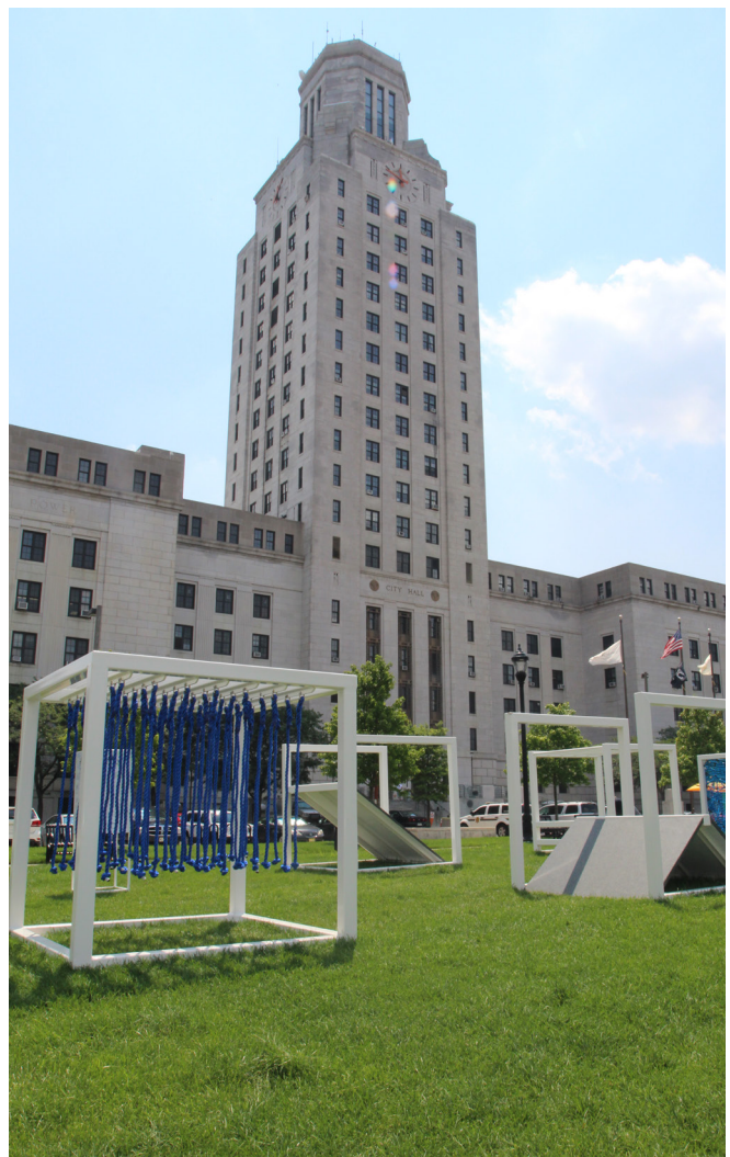
Top: Slides at Coopers Poynt Waterfront Park, former site of Riverfront State Prison. Bottom: CUBES play sculptures await children at Roosevelt Plaza Park in front of Camden City Hall.