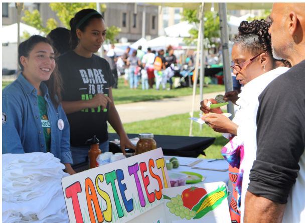
Granola and baked chips make great movie-night treats. CTL offers healthy snacks for the 2017 season.

We carried on this trend by providing healthier alternatives, such as pita sandwiches and hummus instead of pepperoni pizza, for volunteers and participants at CTL festivals and events.