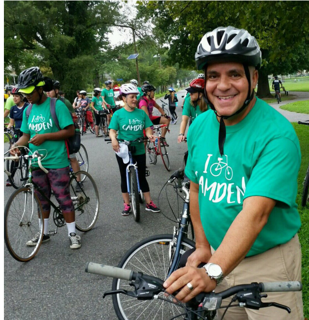
Camden City Council President & Mayor-elect Frank Moran at the head of the pack as cyclists stop for a water break during the "I Bike Camden" event.