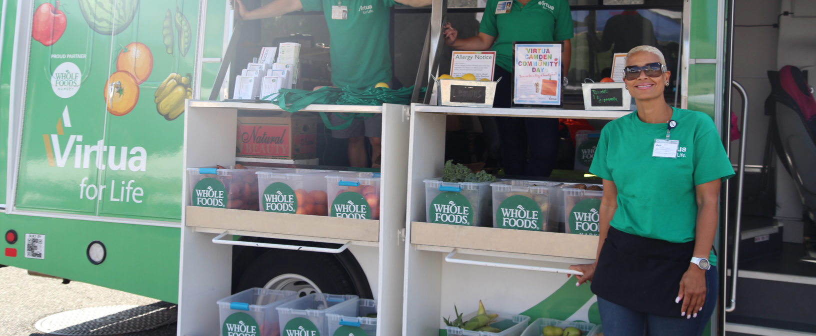
Waiting for customers at Camden's sunny, downtown farmer's market