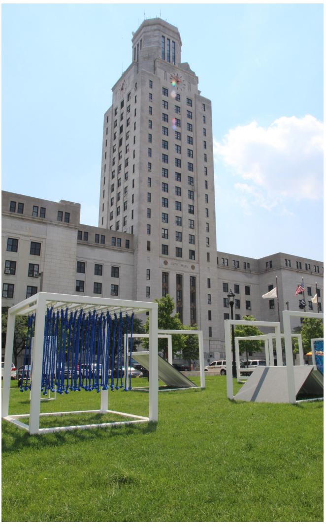
Top: Slides at Coopers Poynt Waterfront Park, former site of Riverfront State Prison. Bottom: CUBES play sculptures await children at Roosevelt Plaza Park in front of Camden City Hall.