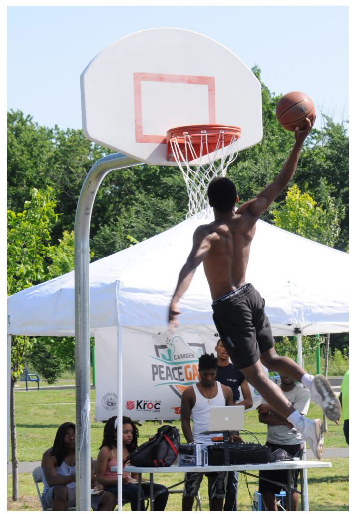
Top: Achieving lift off at the inaugural Camden Peace Games Bottom: It's all love as proud winners display trophies and medals