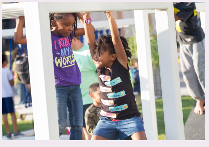
700 PEOPLE ENJOY MUSIC, MASSAGES AND PRODUCE AT THE WEEKLY FARMERS MARKET

65% OF FEATURED TALENT FOR EVENTS WERE CAMDEN RESIDENTS