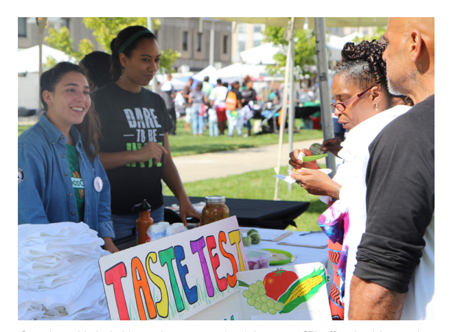
Granola and baked chips make great movie-night treats. CTL offers healthy snacks for the 2017 season.

We carried on this trend by providing healthier alternatives, such as pita sandwiches and hummus instead of pepperoni pizza, for volunteers and participants at CTL festivals and events.