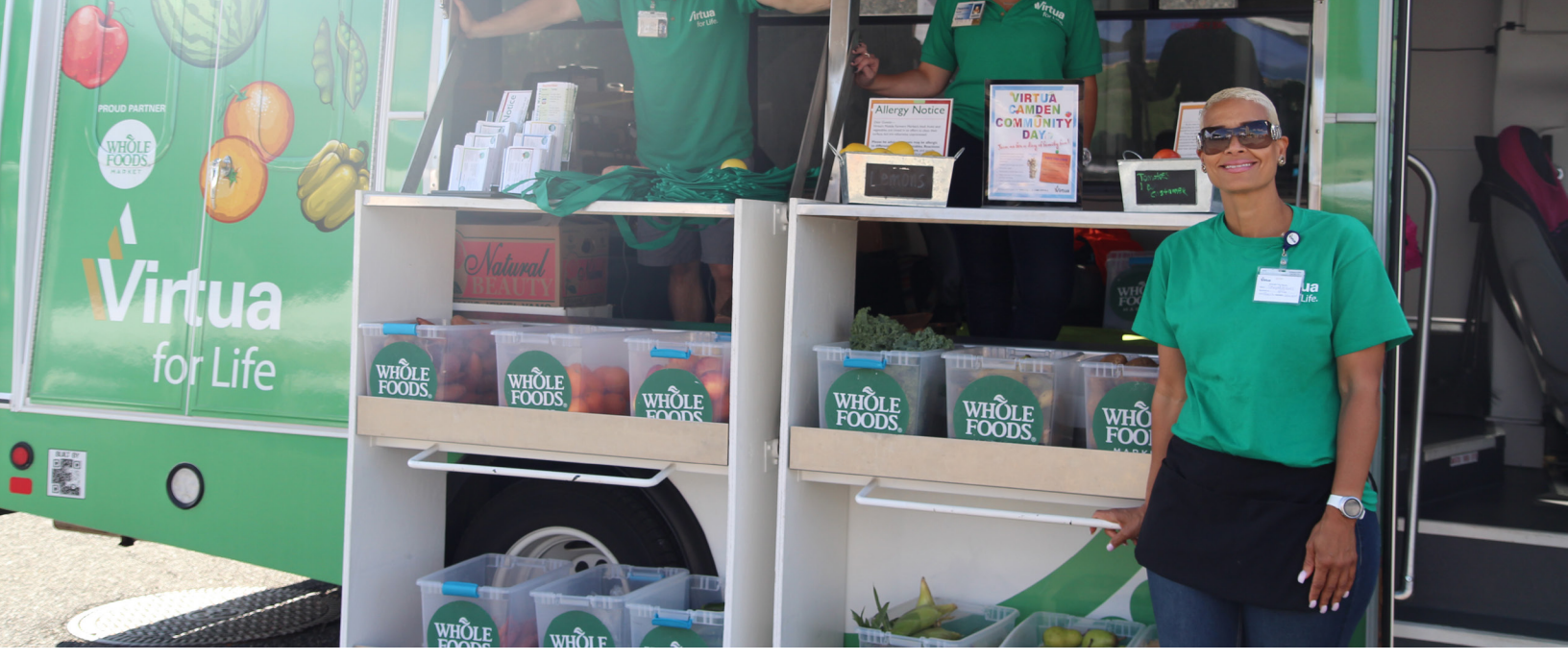
Waiting for customers at Camden's sunny, downtown farmer's market