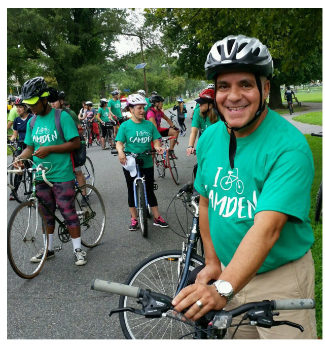
Camden City Council President & Mayor-elect Frank Moran at the head of the pack as cyclists stop for a water break during the "I Bike Camden" event.