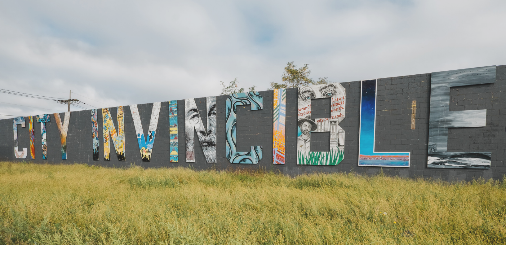
"In a dream I saw a city invincible." - Walt Whitman